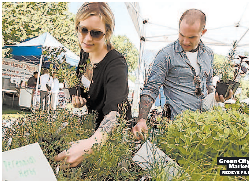
Green City Market REDEYE FILE

The payoff: Learning new ways to stay fit.