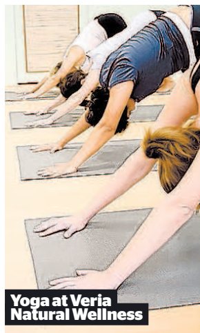
Yoga at Veria Natural Wellness